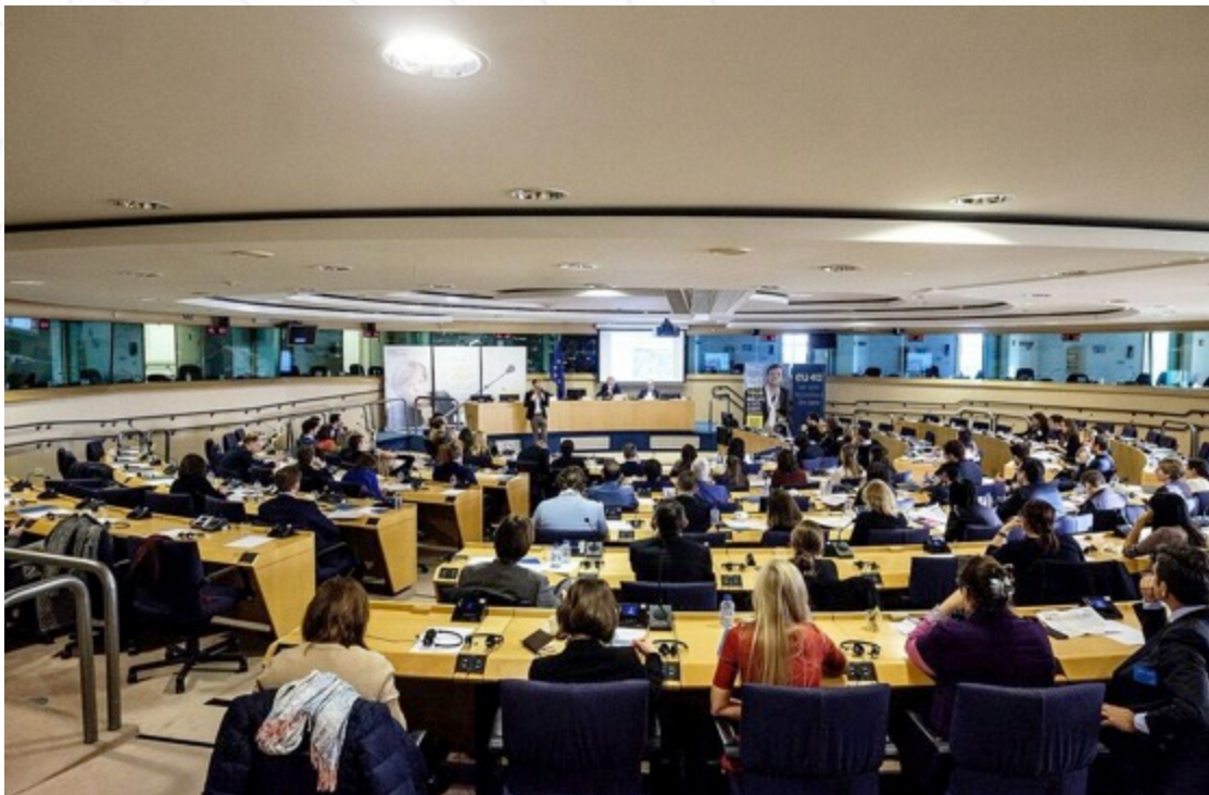
Packed room with the health parliamentarians for the kick-off session