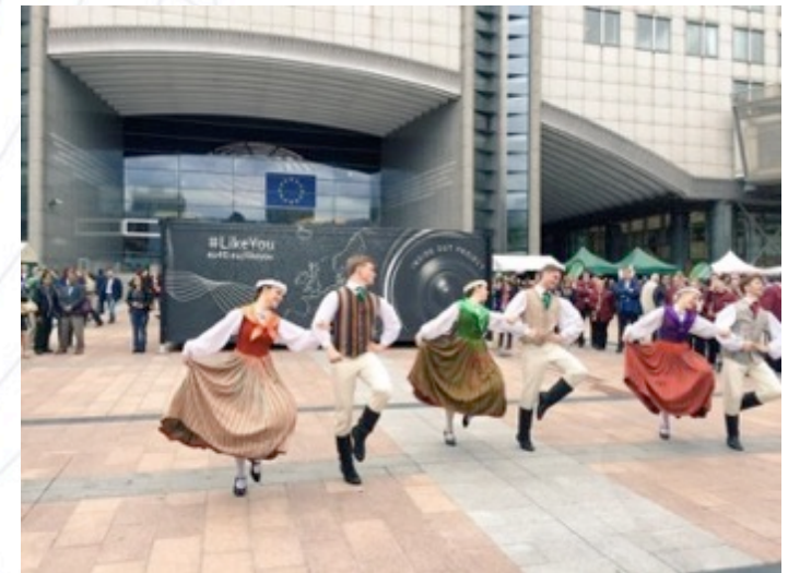
#LikeYou giant photo booth on the Esplanade of the European Parliament

Video available here: https://youtu.be/bERT93oEg4w