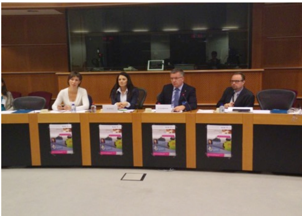
MEP Miriam Dalli (mid-left) and Eirik Wærness (mid-right)

An analytical description of various possible development projections for the world economy, international energy markets and energy-related greenhouse gas emissions was given. The debate generated a dynamic discussion by analysing the changing energy supply and demand, as well by drafting three different long-term scenarios for 2040.