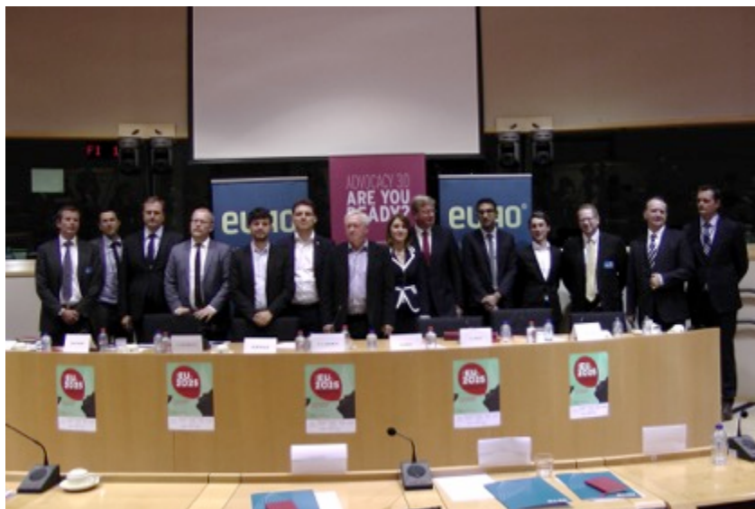
Group picture of panelists and high-ranking guests