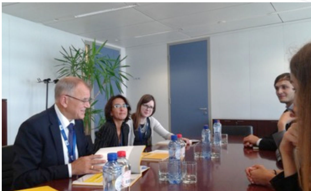
Health Commissioner Andriukaitis meeting EHP delegation

We were happy to see that the Commissioner was particularly interested in topics related to health promotion, prevention, screening, vaccination, new mobile health applications and alcohol labeling/advertising. He gave us some food for thought for the next edition of the EHP 2016.