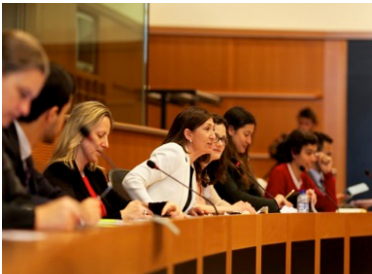
Youngsters debating the conclusions of the survey conducted at European level

MEP Javi Lopez gave an introductory speech and the results of a survey conducted at European level, consulting youngsters' feed-back with respect to the creation of 100 000 jobs, were presented. The young people took part then in three break-out sessions, in order to discuss further on the results of the survey. A spokesperson delegated for each of the three groups presented the outcomes of the discussions in a plenary room gathering all the participants. MEP Martina Dlabajová made the closing remarks.