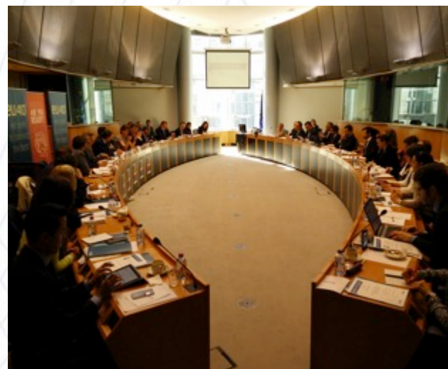
View of the fully-packed venue

Video: https://youtu.be/dZWqYyAkIPY Pictures: http://bit.ly/1IRCfng