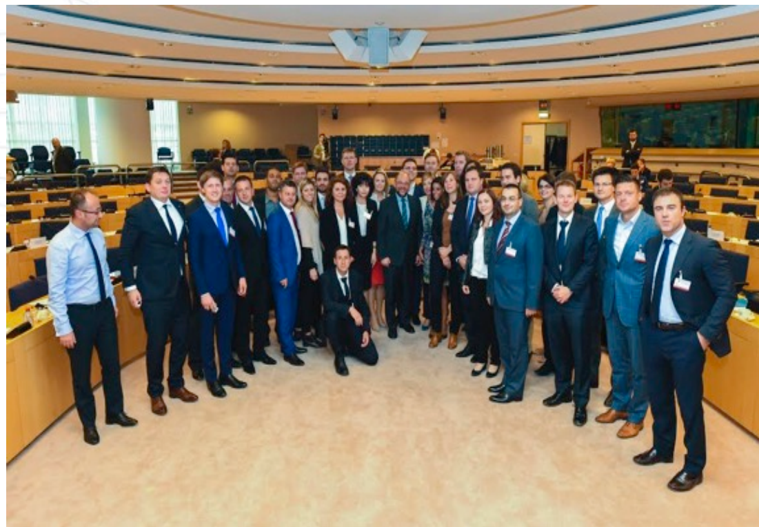
Group picture with the MPs participating and EP President Martin Schulz

We should ideally be able to meet regularly in different European cities; it is our objective to keep the network active and growing. The resolution adopted by the MPs participating will be pushed forward in other institutional settings in order to maximise its impact. We encouraged the MPs to share it with their media contacts back home and introduce elements of it in legislation pieces that will come on the tables of the national parliaments in the upcoming period. We believe we managed to succeed in the challenging endeavour to launch a network, which has the potential to write history and we are already looking forward to next year's edition.