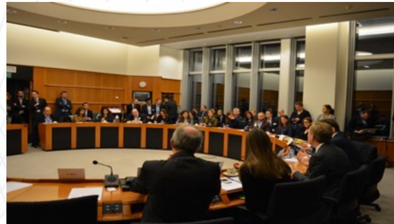
The breakfast debate took place at the EP in a fully-packed venue

Pictures are available at the following link: http://bit.ly/1NsiqVE