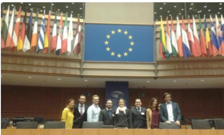
Group picture of MEP van Bossuyt with the Prize winners in the plenary of the European Parliament