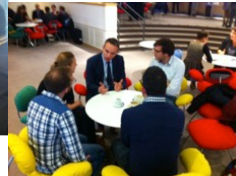
MEP Vandenkendelaere with the winners