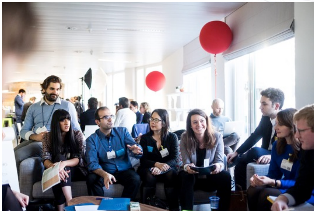
Digital skills for the medical profession committee

In the upcoming months, they will be working on finding bold proposals for a healthier Europe. Their work will be concluded in one paper per each of the sub-Committees and presented in June 2016, at the European Parliament, in front of an audience consisting of a broad range of policy makers and stakeholders.