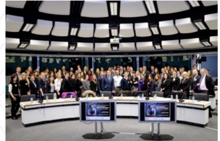
Group picture with all speakers and EHP 2015 Members

Video: http://bit.ly/1PYyA87 More pictures: http://bit.ly/1XqiswH