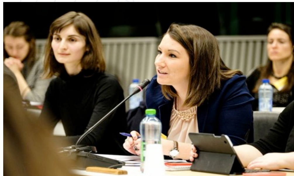
Enthusiastic participants of the Health Parliament, second session