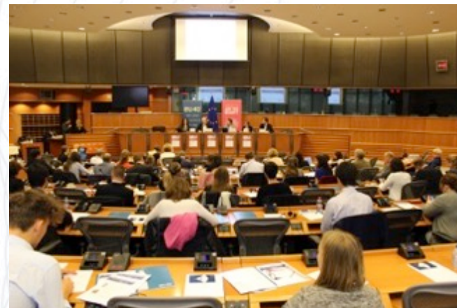
View of the fully-packed venue

Video done by Cambre: https://youtu.be/n0RCy0e4n3I