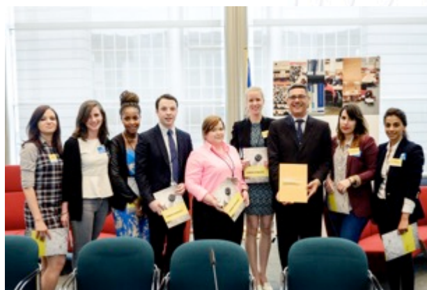
Group picture of MEP Giovanni La Via and Prevention of Chronic Diseases Committee