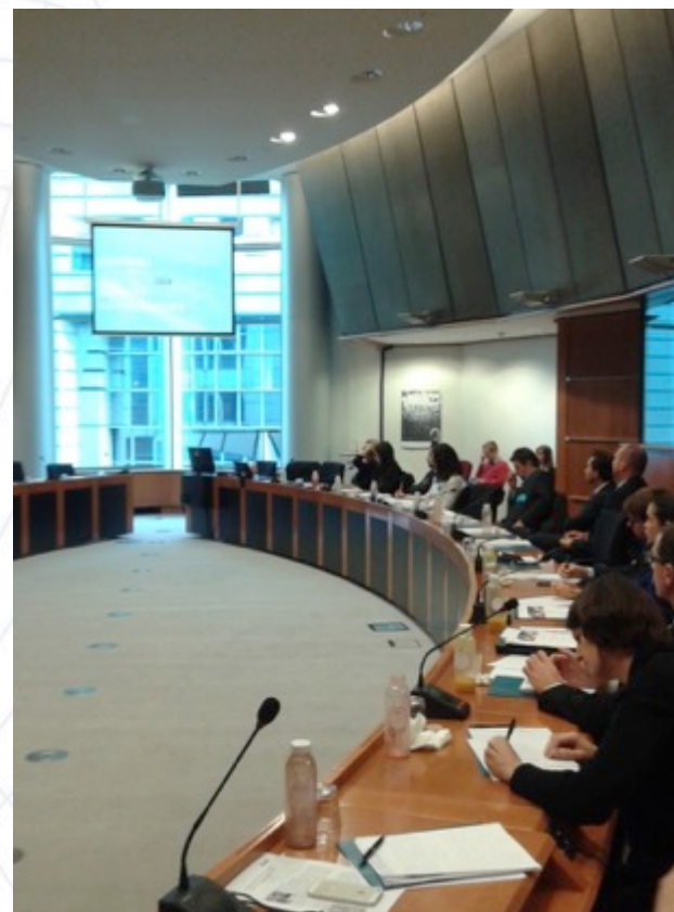
View of the venue