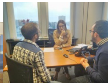
MEP Metsola with the winners