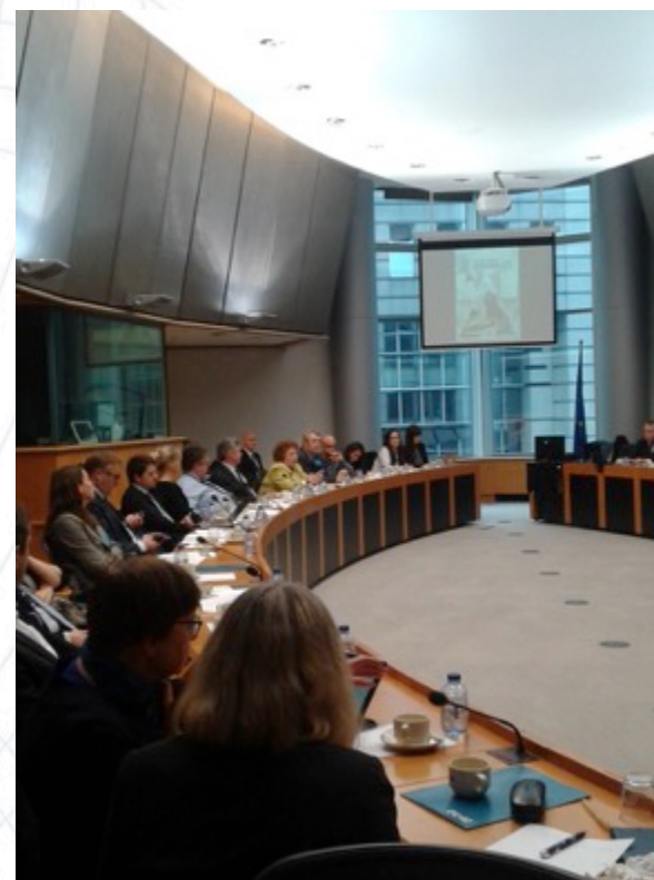
View of the venue