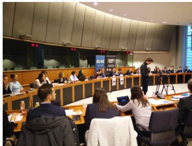
View of the fully-packed venue