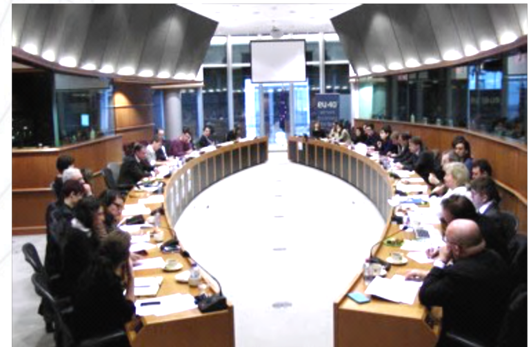
View of the fully-packed venue

More pictures from the workshop are available here: http://bit.ly/1XqksVF