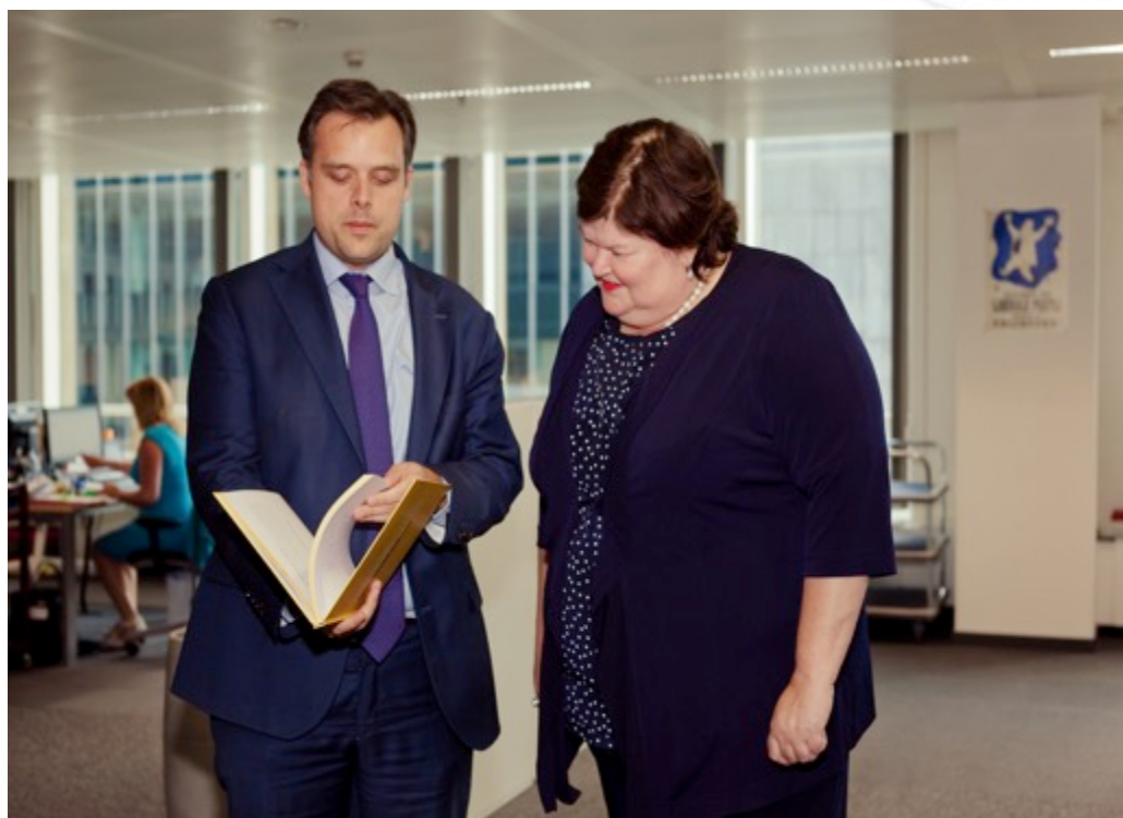
MEP Philippe De Backer handing the EHP book to Maggie De Block

Ms. de Block was happy to receive the paper and said the Ministry is working on files focused on patient centricity and big data and she will try to include some of the recommendations into their work.