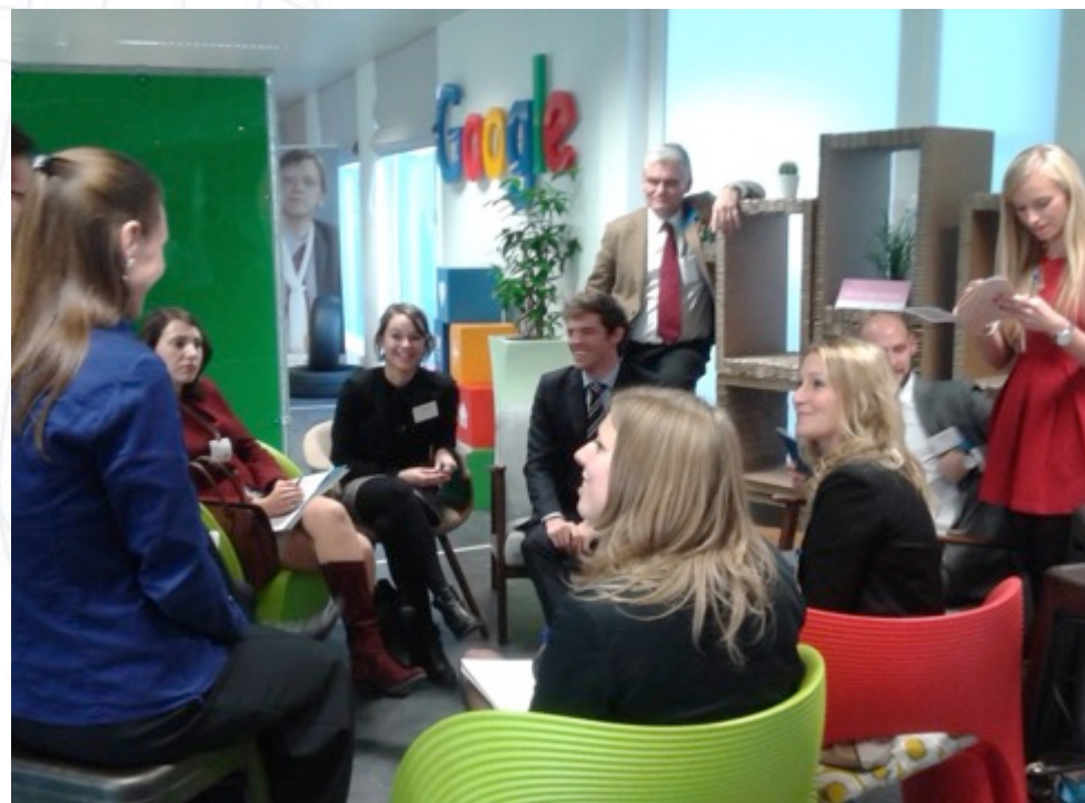
Anti-microbial resistance committee