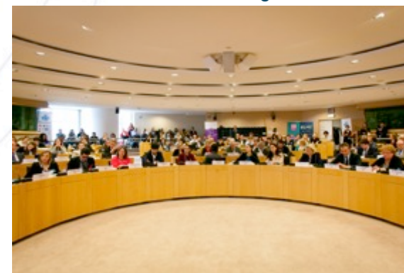
MEPs participating in the conversation (panelists' view)