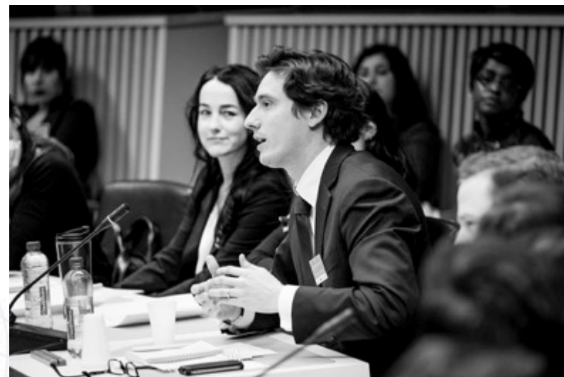
Participants of the Health Parliament, second session

POLITICO’s report is available here: http://politi.co/1Owo43G