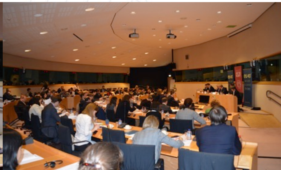
The event took place in a fully packed committee room