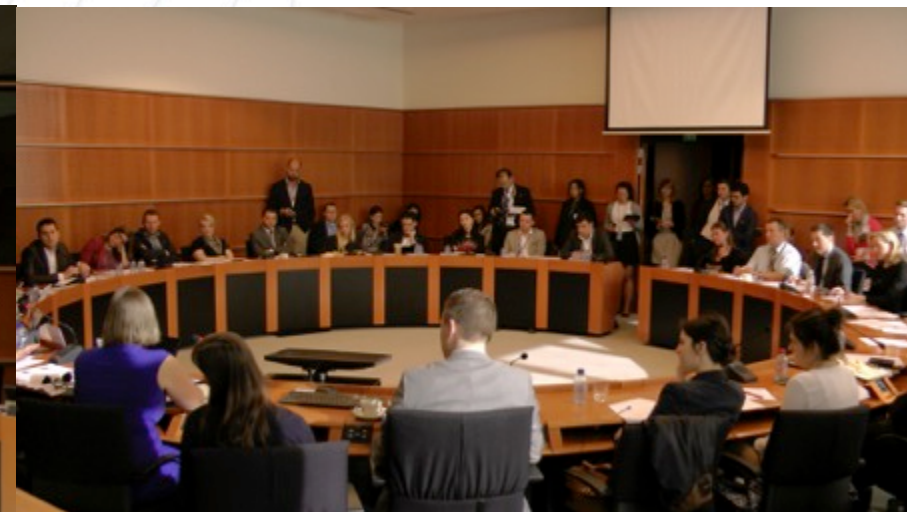
View of the fully-packed venue