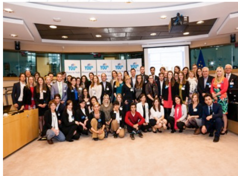
Group picture with all the young participants