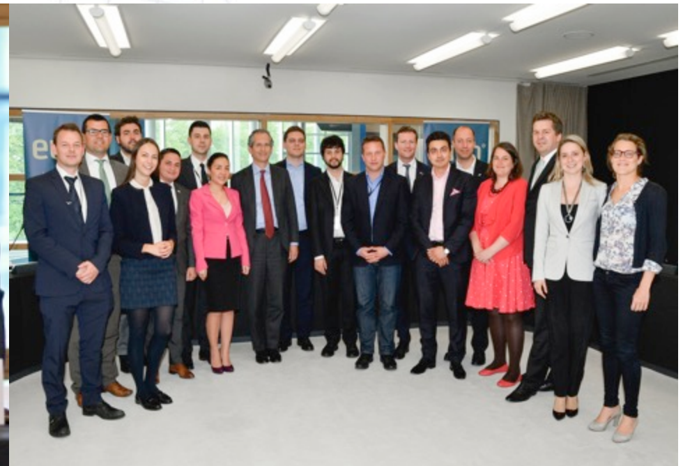
Group picture of Anthony Gardner and EU40 MEPs