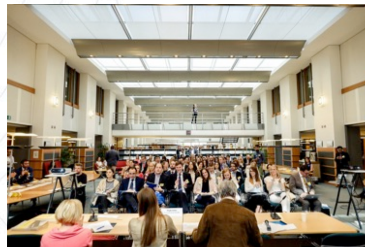
The Library of the European Parliament was fully-packed.

More pictures are available here: http://bit.ly/1AtGmF