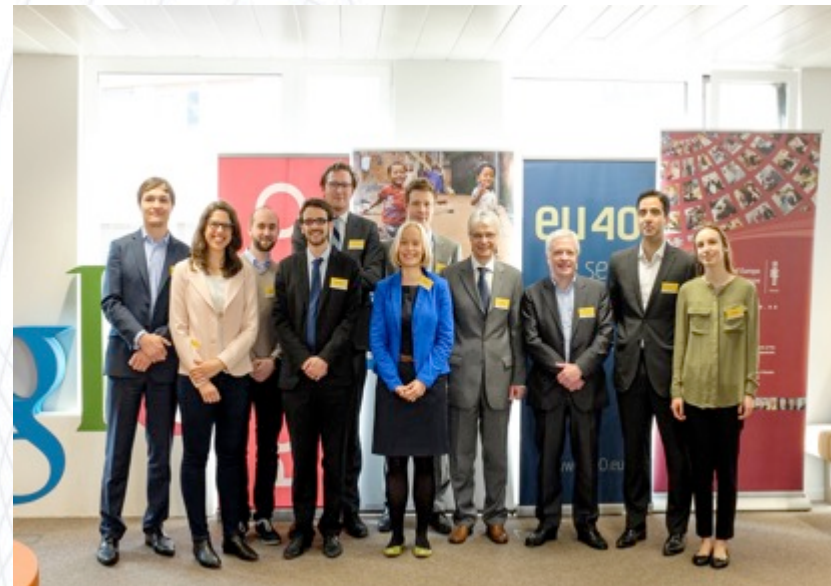
Group picture: Members of the Big Data Committee (EHP) and guest speakers

Video: http://bit.ly/1XvksDT More pictures: http://bit.ly/1Ok16kG