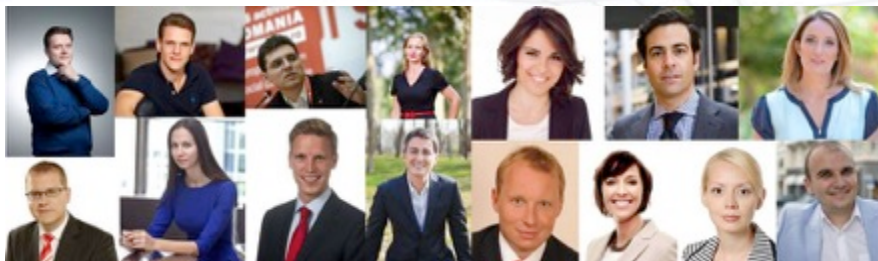
EU40 MEPs nominated for the MEPs Awards 2015