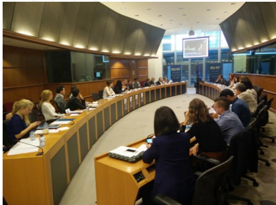
View of the fully-packed venue