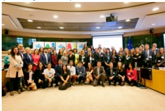
Group picture with all the participants

The initiative was supported by the European Commission and the EPP Group of the European Parliament and had extensive media coverage.