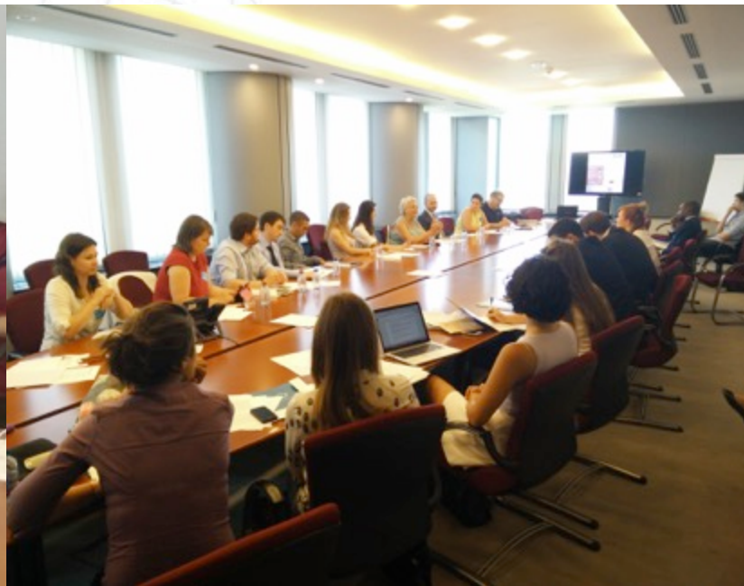
The event took place in a fully packed venue