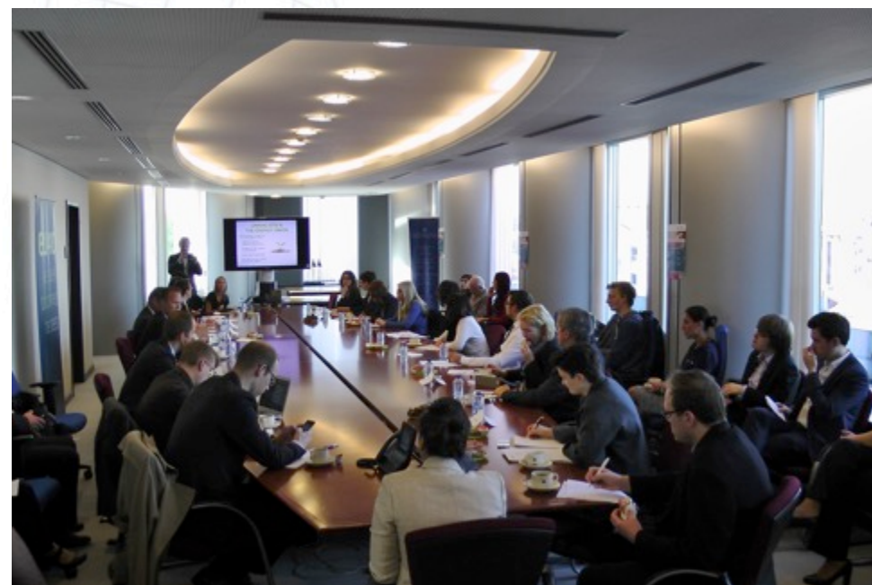
Attendees enjoying the bagel breakfast debate