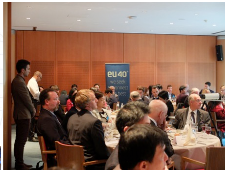
View of the fully-packed Members Salon