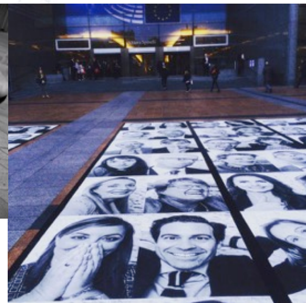
#LikeYou exhibition on the Esplanade of the European Parliament